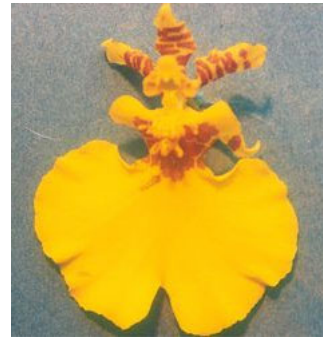
Onc Grower Ramsy

Onc. varicosum. This is the original Dancing Lady with its large, bright yellow lip, which dominates its hybrids.