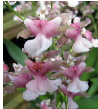
Onc Rosy Sunset

Onc. Sharry Baby. This is the famous chocolate smelling orchid.