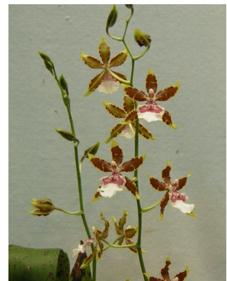
Onc Jungle Monarch

Onc. Spacelatum. One of Bobby Ignacio's flowers.