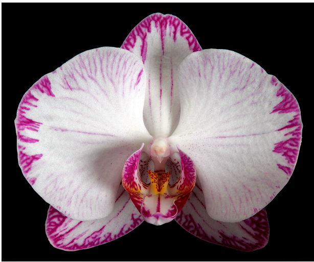
Dtps. Minho Princess