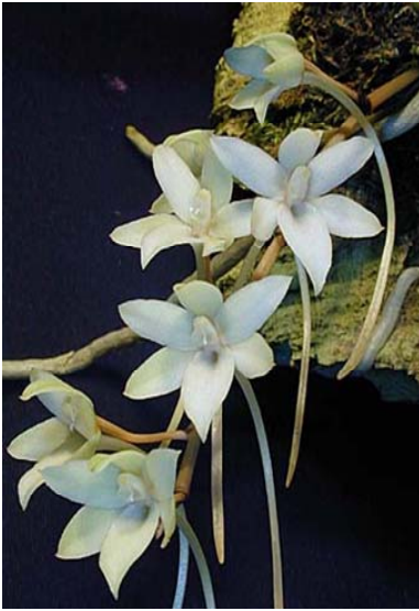
Aerangis Mystacidii Zimbabwe (Mounted)