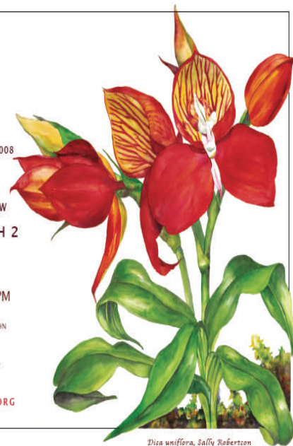
Dian uniflora