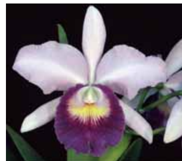
Lc. Blue Dynasty 'Blue &