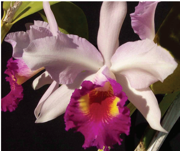
Lc Aqui Finn Grown by Tom Renger

South Bay Orchid Society c/o Sabrina Roque 916 Silver Spur Rd., Ste. 201 Rolling Hills Estates, CA 90274