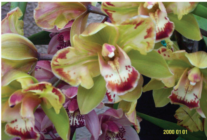
Cym Isle Flamingo '3 lips' Grown by Tom Renger