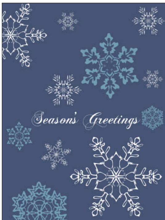
Icons by DryIcons at http://dryicons.com

South Bay Orchid Society c/o Sabrina Roque 916 Silver Spur Rd., Ste. 201 Rolling Hills Estates, CA 90274