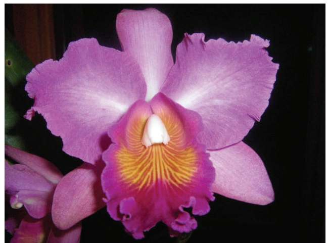
Lc. Mary Ellen Carter 'Dixie Hummingbird' x Bc. Mac Holmes 'Raye'