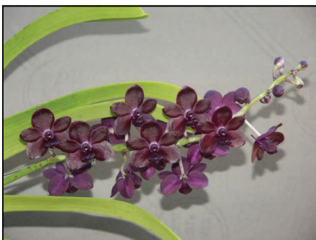
Rhy Srisiam (Gigantiem x Suree)