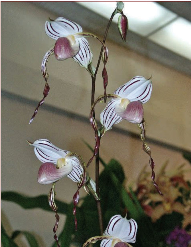
Paph stonei 'Latifolium' ver Kennedy