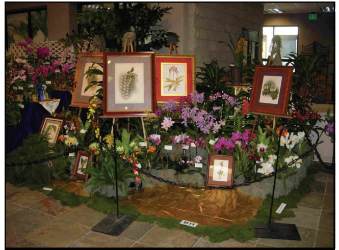
WE WON BRONZE !

I want to personally thank those who helped to make the South Bay Orchid Society's display at the AOS 'Golden Age of Orchids' Show one of our best ever.