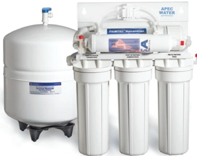
Apex Reverse Osmosis

I will try to explain my system. If you really want to follow the path of the water, draw it on a piece of paper as we go along. Starting point is the city water which goes to a Syphonex fertilizer and to a hose bib. Tap water then is available either enriched or straight.