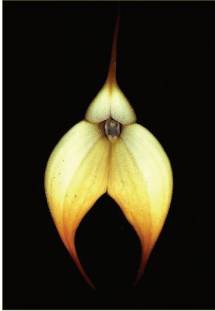
Masdevallia Mary Staal 'Alpine'