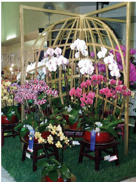
Zuma Canyon Orchids' display at AOS 2009 Fall Show

Life members – please – do make sure that we have your current information on file.