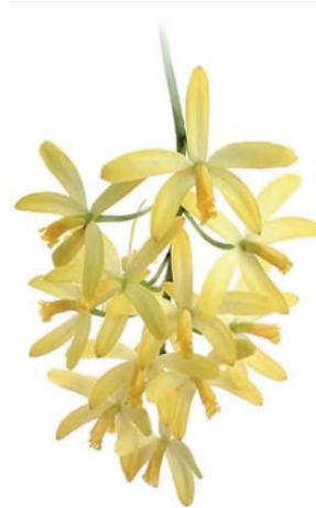
Laelia flava