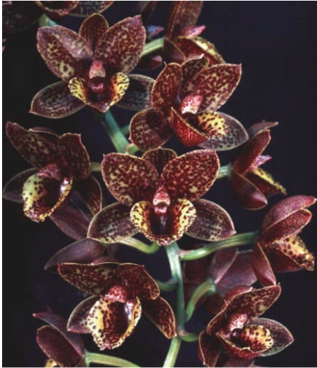
Ctsm After Dark