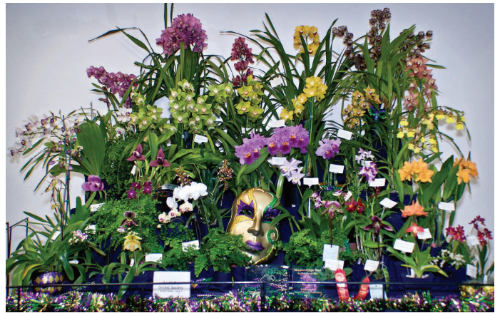
Imagination at work!