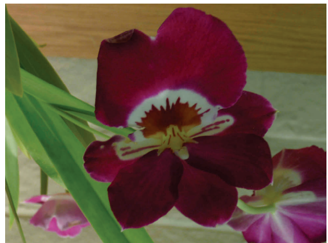
Miltonia Kathy West