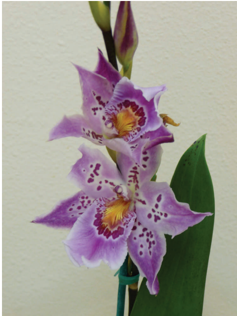
Vuylstekeara Carnivale 'Rio' Grower: Nick Braemer