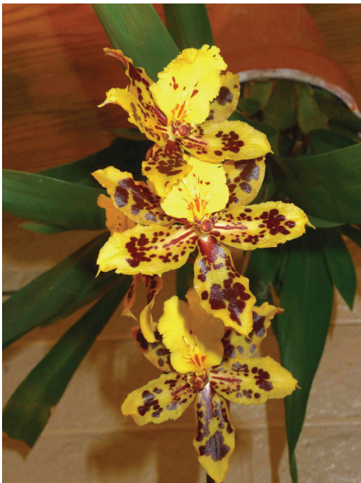
Oncidium Danee Petrich