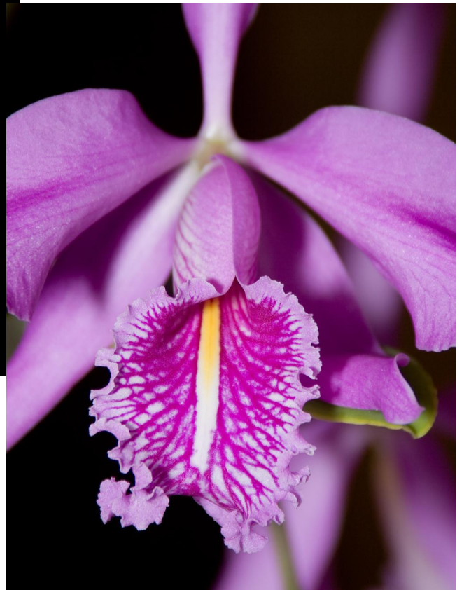
C. maxima Grower: Tom Renger

New members: When you come to the next meeting, stop by the membership desk to pick up your name badge and a new member package. We will include ten free plant table raffle tickets as our "thank you" for joining SBOS.