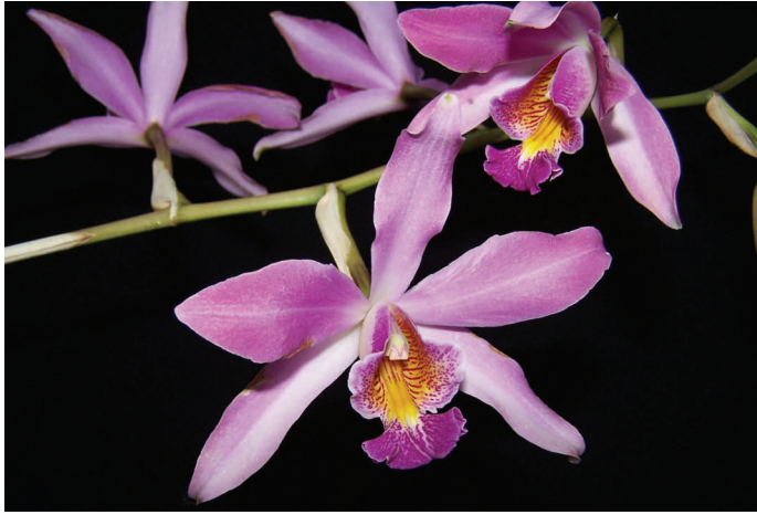
Schomburgkia sawyeri