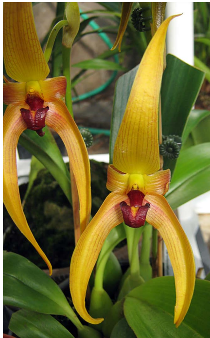
Bulb. Betty Kelepez 'Windflower' AM/AOS