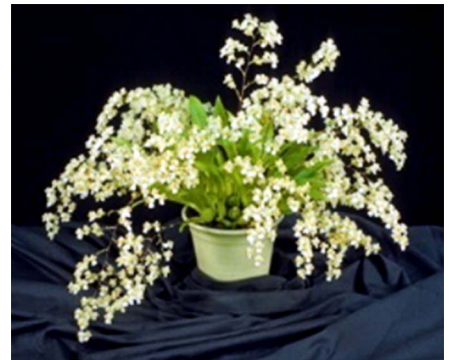
Oncidium twinkle 'Windflower' CCM/AOS