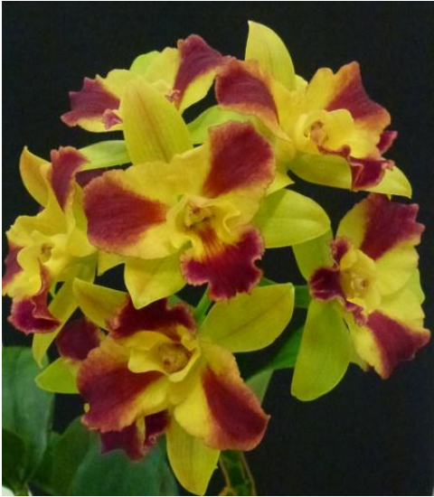
Pot. Burana Beauty Grown by Tom Renger