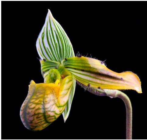
Paph. Venustum Grown by Don Goss