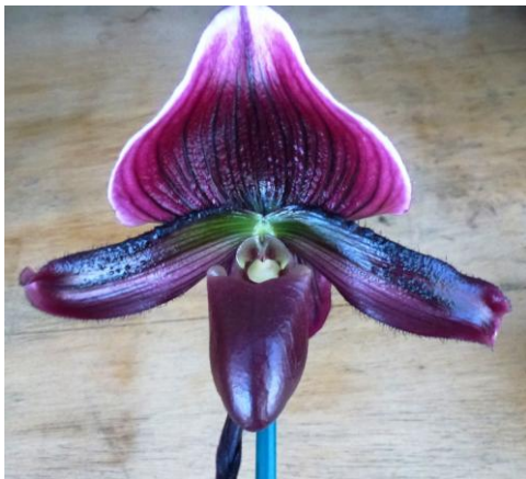
Paph. Hsinying Love X Laser 'Hsinying Flame' Ching-in BM/TPS (Ching-Hua)