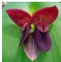
Pleurothallis Bev Bebrincant