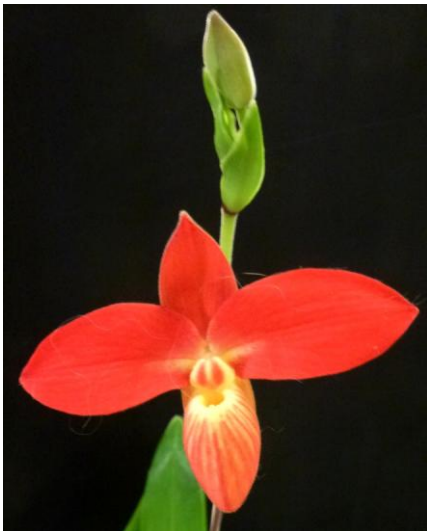
Besseae 'Haven Smokin' Grown by Dave Streeter