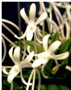
Neofinetia falcata “Amami Island” Grown by Jim Hoyle