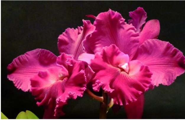
Blc. Lawless Walkiire "The Ultimate" Grown by Dave Streeter