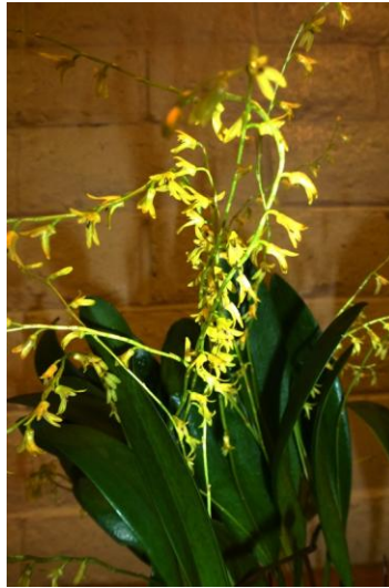
Speaker's Choice Pleurothallis platystylis Grown by Nick Braemer