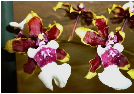
Onc. 'Space Race' "Coco" Grown by Fe Woods