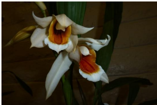
Coel. 'Memoria Louis Forget' Grown by Fe Woods