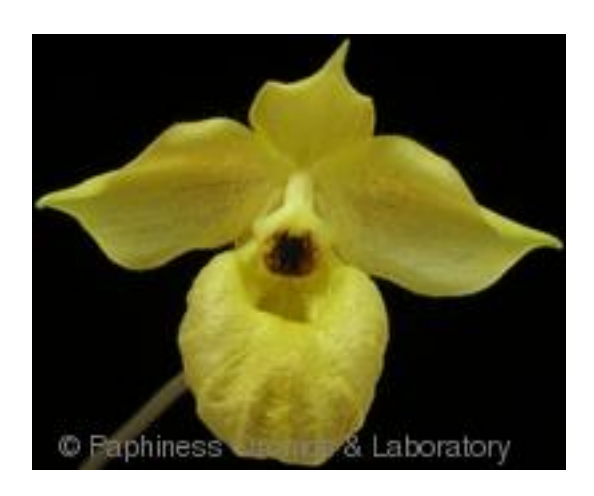
P. Norito Hasegawa