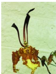
Psychopsis Mariposa 'Green Valley' Grown by Sylvia Eastwood