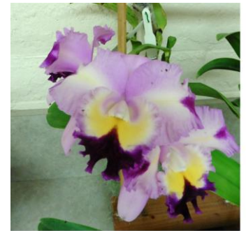
Lc. Casitas Spring X C. Little Dipper 'Sato'