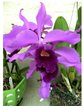
C. Gaskelliana 'June Surprise' X Laelia Purpurata flamea 'King'