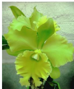
Lc. Kat Green Power 'Big Trios'