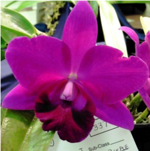
C. Mini Purple 'Princess Road' Grown By Earl Felt