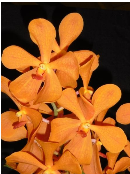
Mokara Moonlight 'Bright Orange' Grown by Wilma Tawagon