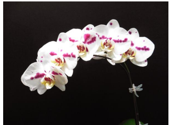
Phal. Yu Pin Grown by Sylvia Eastwood