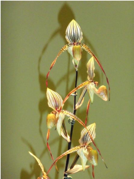
BEST OF SHOW Paph. St. Swithin Grown by Dave De Young