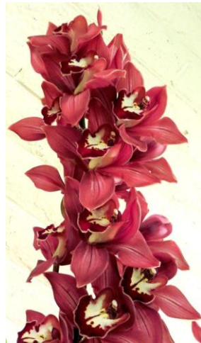
Cym Red Beauty 'Evening Star' Grown by Robert Fisher