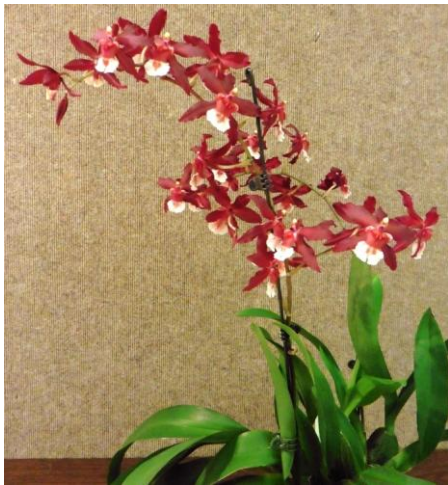
Ondoglossum oncidium Grown by Sylvia Eastwood