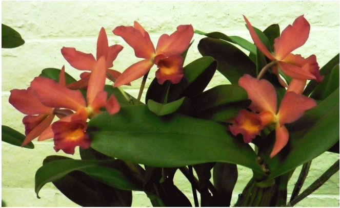
Blc. Waiomao Fantasy Grown by Sylvia Eastwood