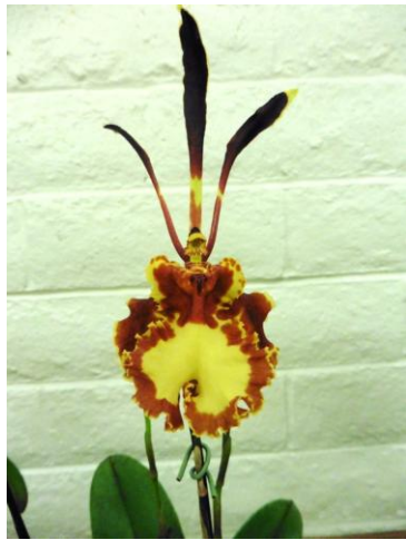
Psychopsis krameriana Hybrid