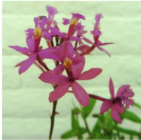
Epi. Radicans 'Purple'