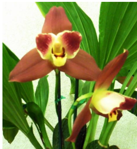
Lyc. Geyser Gold X (Capricorn Vulcan X Angest Paul Gripp)