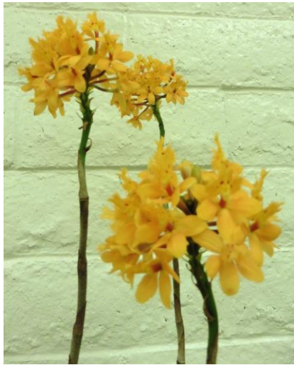
Epi. Pacific Lava 'Lipstick' X Pacific Sparkler 'Sunrise'