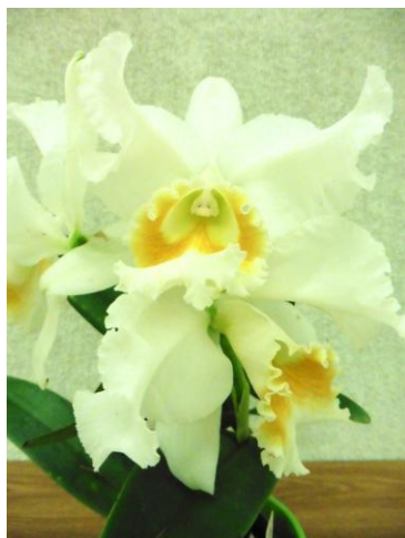
C. June Wedding