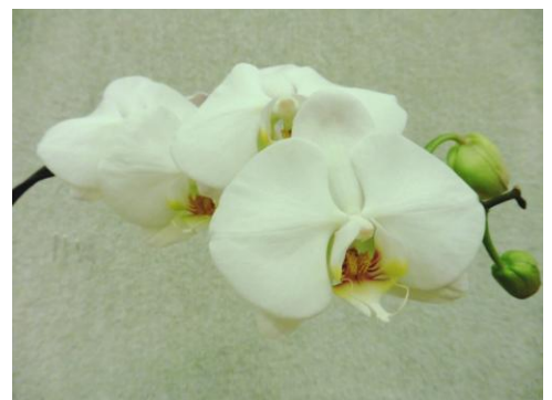
Phal. Sogo Yukidian