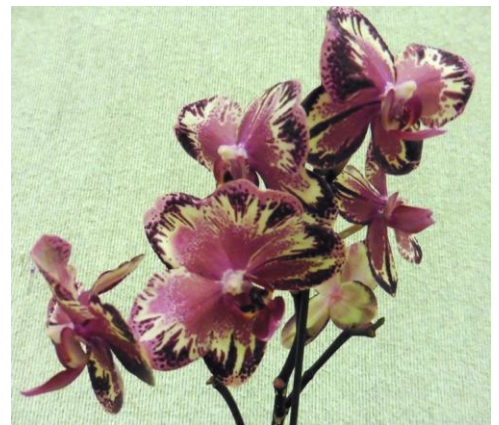
Dtps. I. Hsin The Big Bang