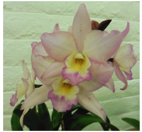
Iwanagara Apple Blossom