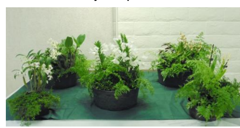
Orchids & Gardens