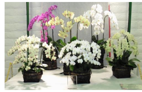
Zuma Canyon - Best of section