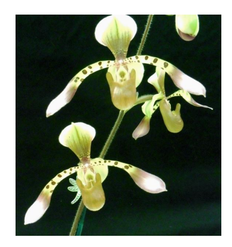
Paph. Ionii 'Compact' Grown by Sylvia Eastwood