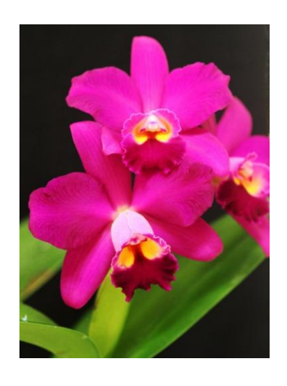
Slc. Marcia Streeter "Streeter's 1<sup>st</sup>"