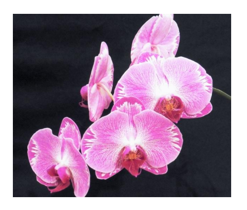
Dtps. Fuller's Sunset 'Firebird' Grown by Sylvia Eastwood