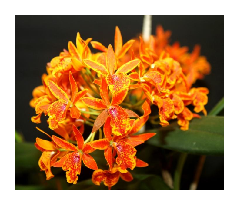
BEST OF SHOW C. Volcano Trick 'Paradise' Grown by Larry Bergen