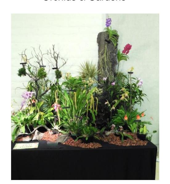
Lico Orchids- Best Vendor exhibit