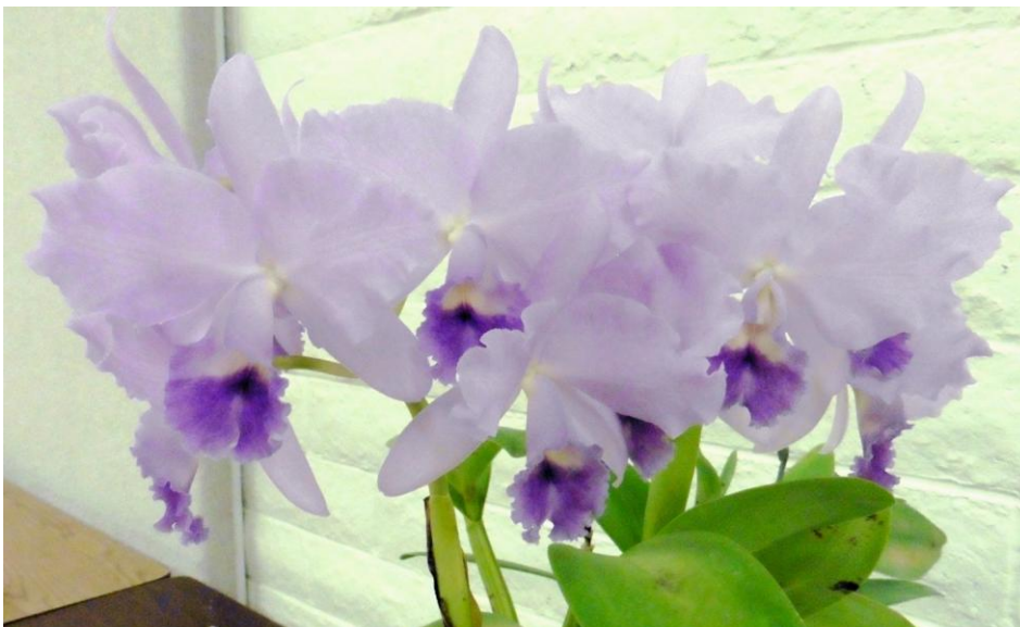
Blc. Lois McNeil "South Bay"