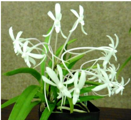
Neofinitia Falcata (nee-o-fin-AY-tee-a)