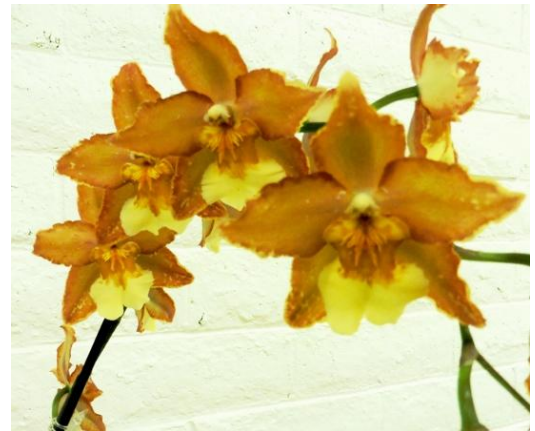
Oncidium (on-SID-ee-um )