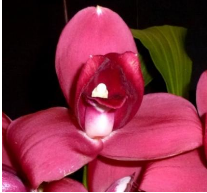
Lycaste ( lye-KAS-tee)