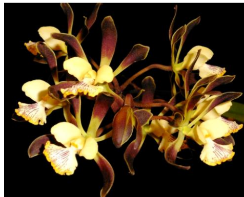
Encyclia (en-SEE-lee-ah )