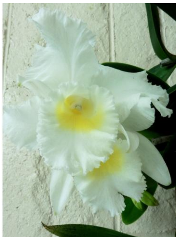
C. Angel Bells