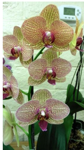
Phal. 'Alley Cat'