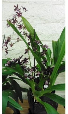
Onc. Sharry Baby