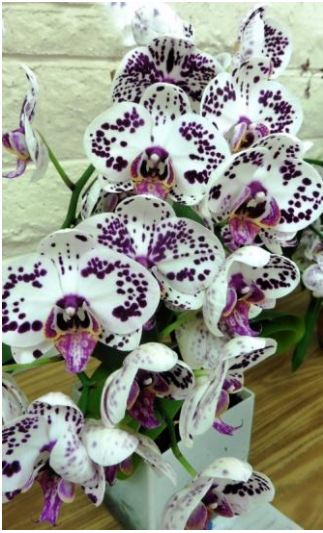
Speaker's Choice Phal. "costco" Grown by Ruben Chicas