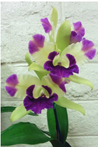
Epic. Mae Bly Ching Hua Splash