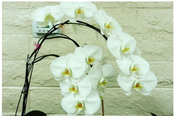
Phal. Sogo Yukidan