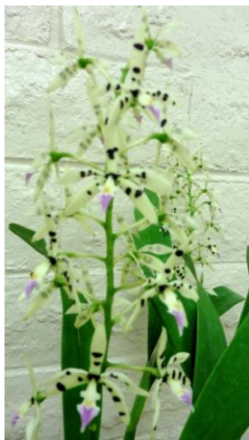
Panarica (Encyclia) prismatocarpus