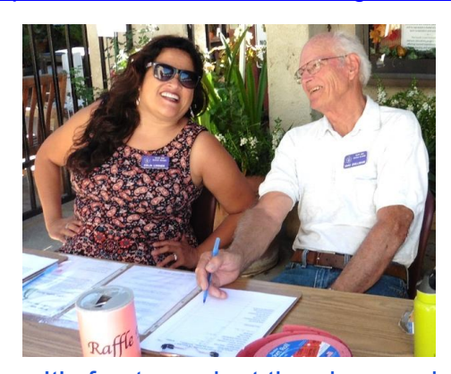
It's fun to work at the show and meet new friends!