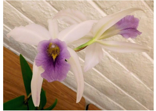
Lc. Blue Stars grown by Arthur Hazboun