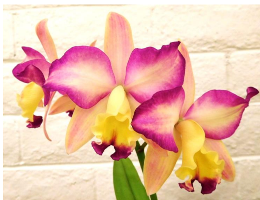
Blc. Love Blush X Blc. Fantasy Love grown by Earl Felt