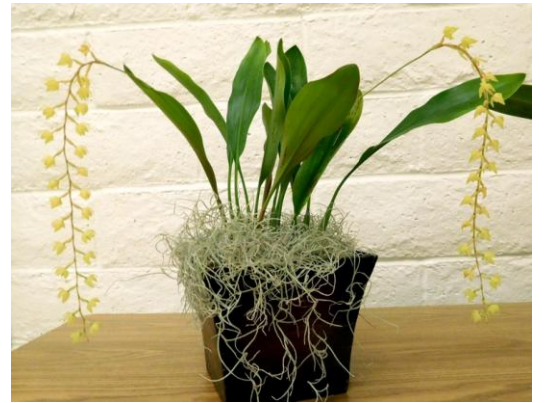
Dendrochillum pangasinanense grown by Braulio Mena