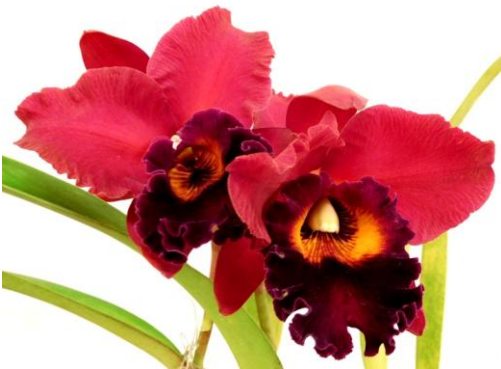
Potinara Red Crab 'Kuan Miao' grown by Braulio Mena