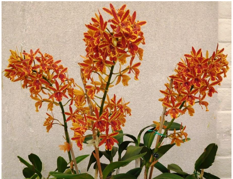
Speaker's Choice Epicat Volcano Trick Paradise