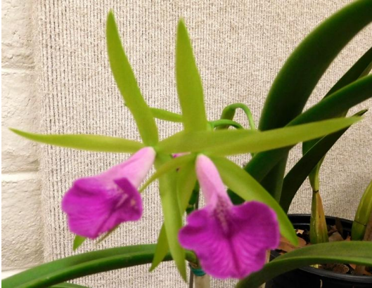
Bc. Carnival Kids 'Green Gem' Grown by Don Goss