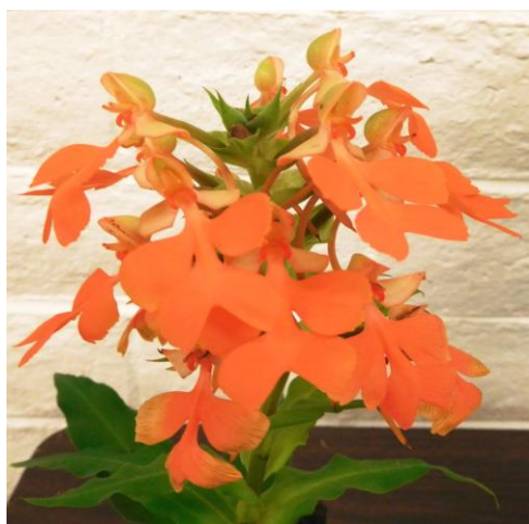
Habenaria rhodocheila Grown by Don Goss