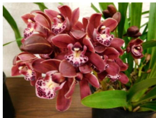
Cym. Sweetheart X pipeta Grown by Luda Kuprenas