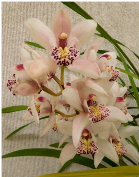
Cym. insigne subsp. Seidenfadenii X Cyndy Lou "Geyserland" Grown by Fe Woods