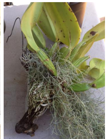
Plants grown, mounted, and photographed by Arthur Hazboun