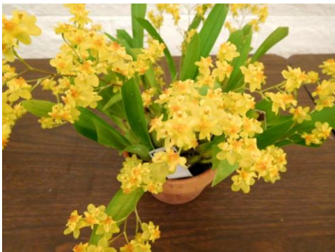
Onc. Twinkle Grown by Fe Woods