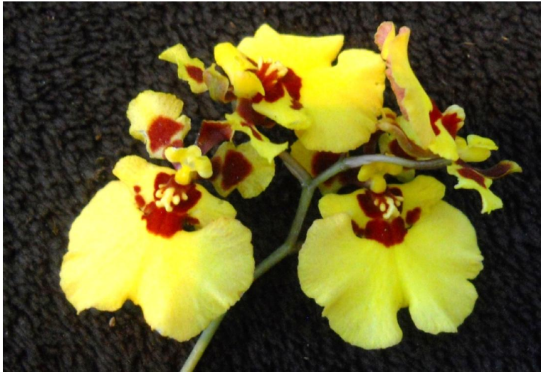
Tolumnia Grown by Nick Braemer

Our meeting will be held in the classroom not the main hall .