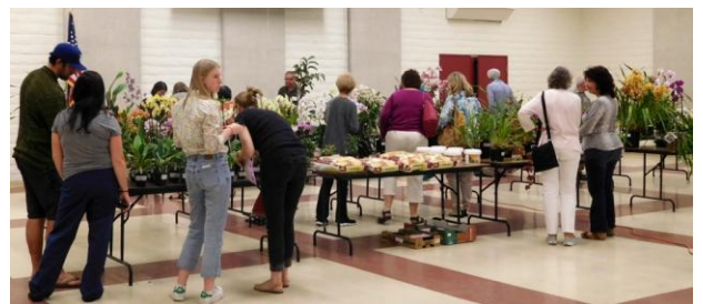
South Bay Orchid Society