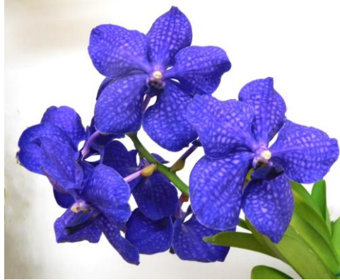
Vanda Pachara Delight 'Pach Ave.