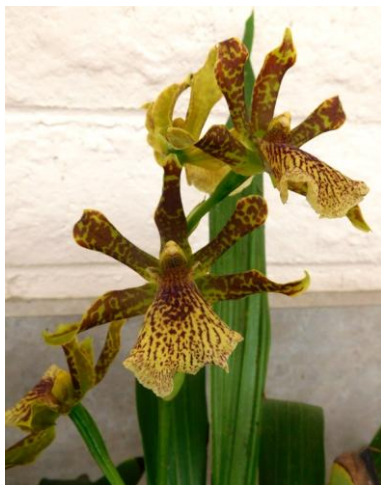
Zygo. AGWA Kiwi Gold 'Nugget'