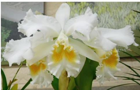
C. June Wedding