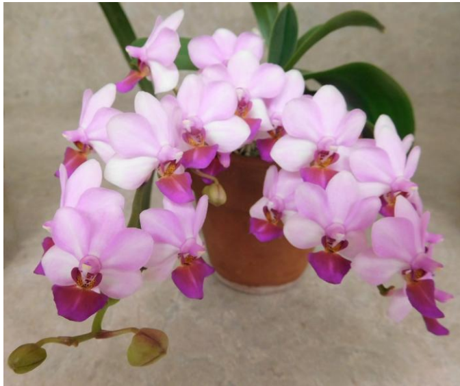
Phalaenopsis unknown Grown by a guest