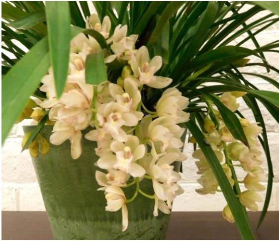
Cym. Polly Stark 'Dos Pueblos'