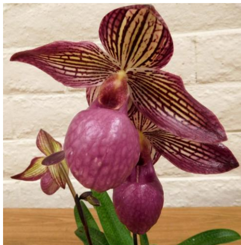
Paph. Gloria Naugle