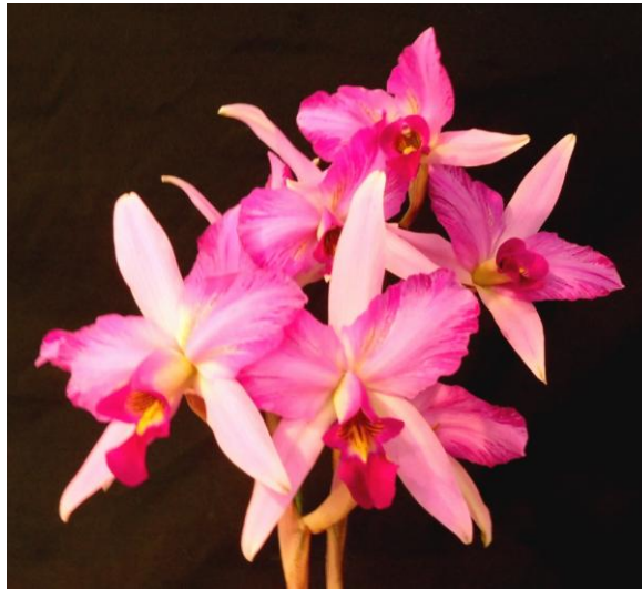
Speaker's Choice: L. anceps var . lineata 'Marcy's Valentine'