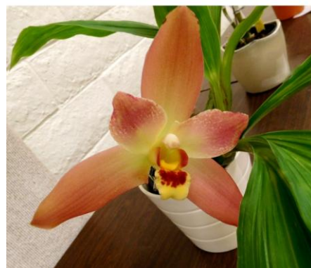
Lysudamuloa Red Jewel