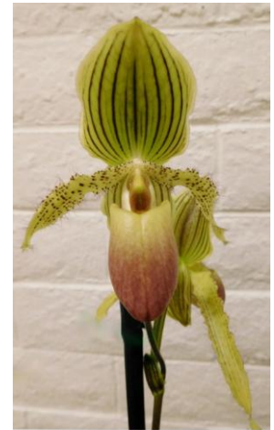
Paph. Prime Child