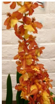
Oncda. Volcano Midnight 'Volcano Queen'