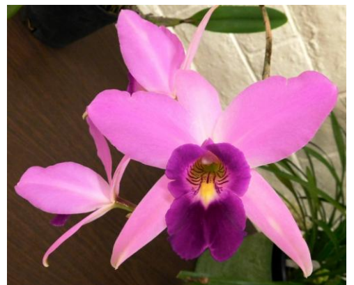
L. anceps 'Hoang'