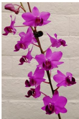
Dtps. Firecracker 'Malibu'