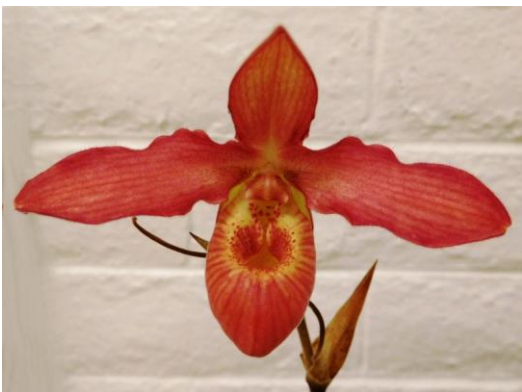
Phrag. Andean Fire