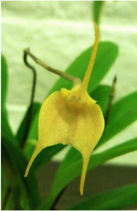
Masd. Pixie Treasure 'Antique Gold' Grown by Ruben Chicas