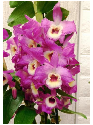
February Speaker's Choice Pot. Shinfong Little Sun 'Golden Boy' Grown by Ksenia Kulakova