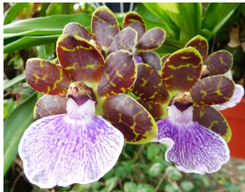
Z. Night Hawk 'Buxom' AM/AOS X Z. Fandango 'Prolific' AM/AOS