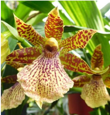
AGWA Kiwi Gold 'Nugget'

or contact Simone Friend at simonef@orchiddigest.org or call (562) 431-1247. When contacting by email, please include phone number, email address and mailing address. Space is limited so don't wait to make your reservation.