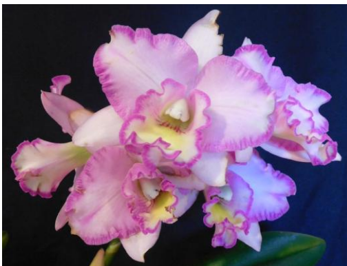
C. Picotee Passion