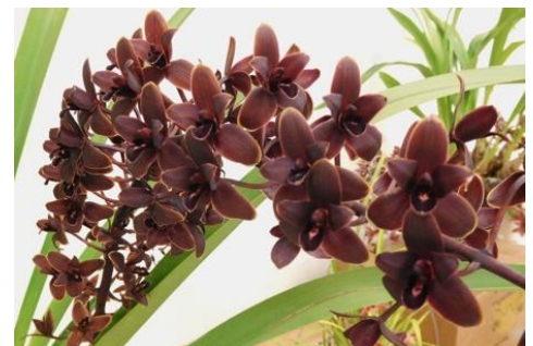
Cym. Little Black Sambo 'Black Magic'