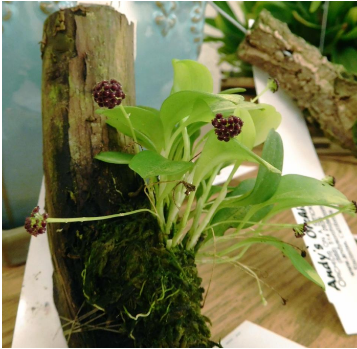
May Speaker's Choice Platystele Umbellata Grown by Ruben Chicas