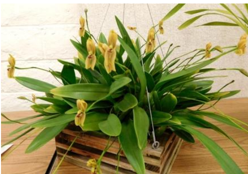
Mormolyca Ringens 'Hobgoblin'