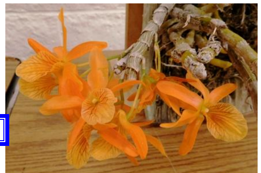
Den. Stardust 'Firebird'