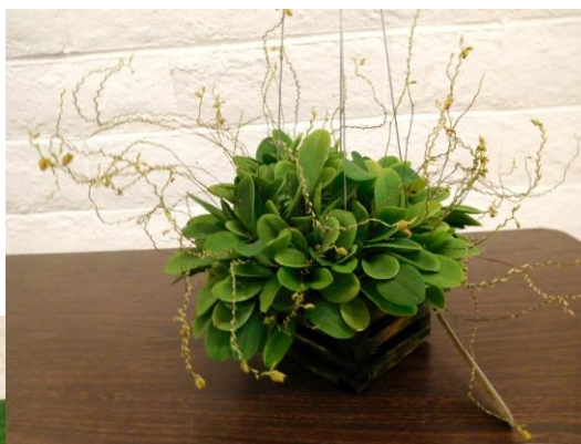
Speaker's Choice Scaphosepalum verrucosum Grown by Jim Hoyle