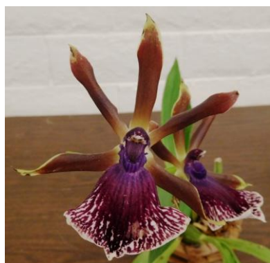
← ← Zygo. Mackii