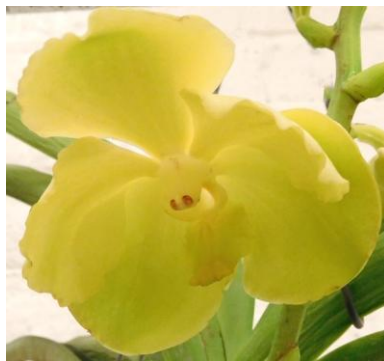
Blc.. Sarah Palin 'Governor'