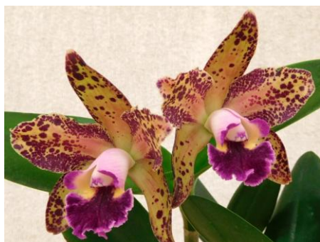
Blc. Waianae Leopard 'Ching Hua'