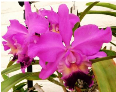
C. Leopoldii 'Super Spot' X