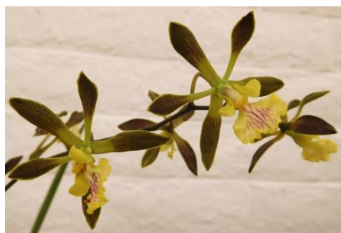
Encyl. Renate Schmidt X Encyl. aspera