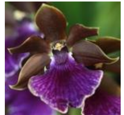
Gptrr. Black Knight 'Buxom'