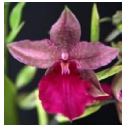
Atc. Cedar Creek 'Chocolate' X