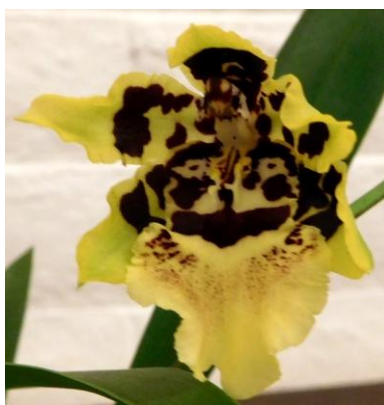
Ondocidium Wildcat Green Valley