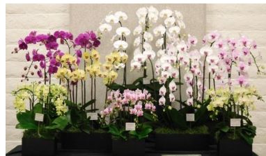
South Bay Orchid Society