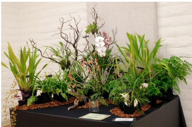
Lico Orchids Display