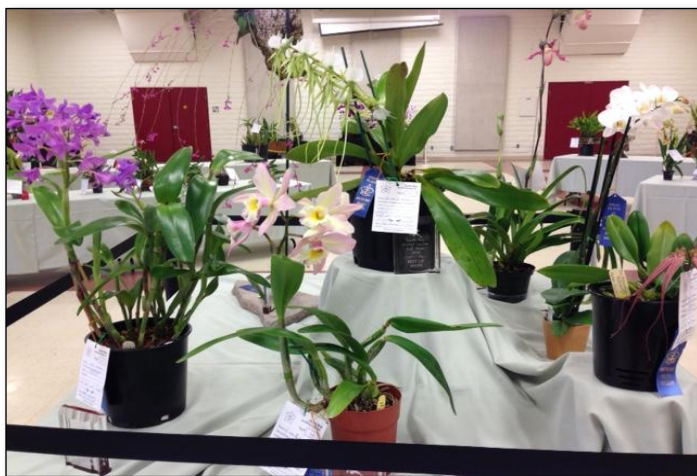
Best of section winners