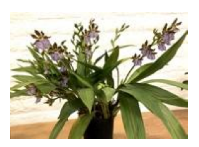
Zygo. Arthur Elle Grown by Larry Bergen

A large selection of Spiking and Blooming Cymbidium Plants. Thousands of first-bloom seedlings. All one of a kind. All colors, shapes, and sizes. Buy direct from local grower. Plus, many award winning show bench and collectible cymbidiums. Experts on hand to answer all your questions.