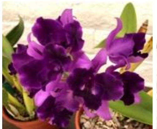
Lc. Rosette Warland X C. Chocolate Drop 'A Cluster of Red'