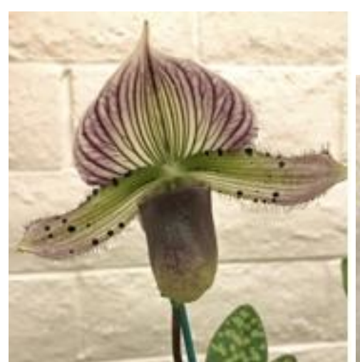
Paph. Supersuk 'Eureka' X Raisin Pie Hsinying X sib