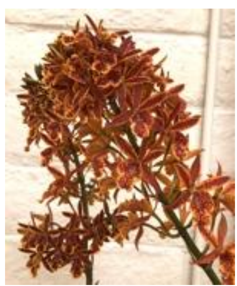
Speaker's Choice : Epic. Volcano Trick 'Paradise'