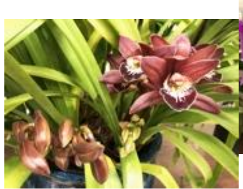
C. Bryce Canyon