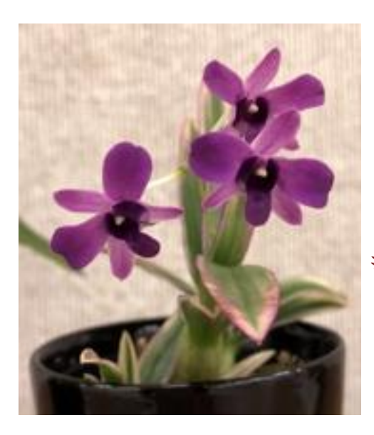
Den. Bigibbum Rainbow