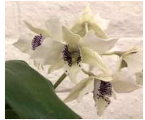
Den. Royal Wings