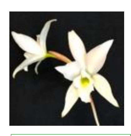
L. anceps 4N (Barkeriana X vestalis 'Figment') First bloom from raffle table plant