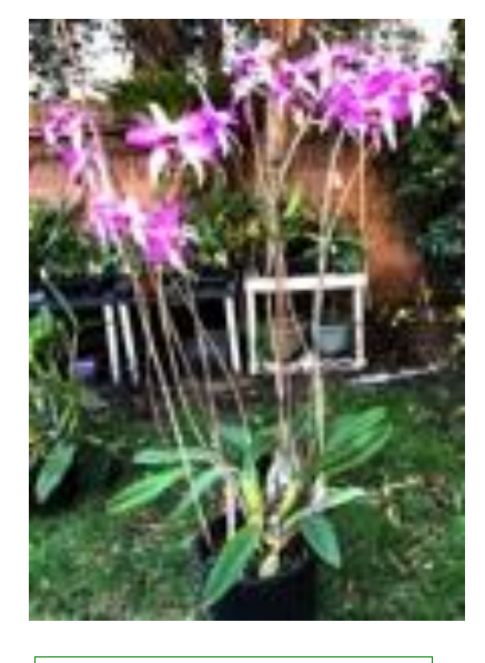
L. anceps var. lineata