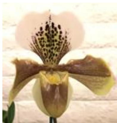
Paph. Lady Luck