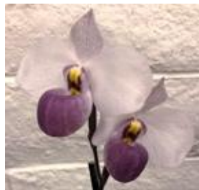
Paph. Delenatii Dark Pouch