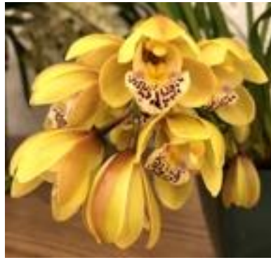
Cym. White Rabbit