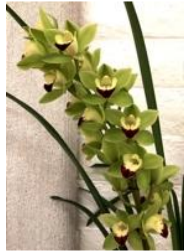
Cym. Blue Smoke