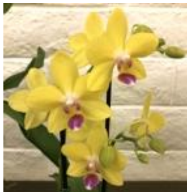
Phal. Gold Tris 'Sweetheart'