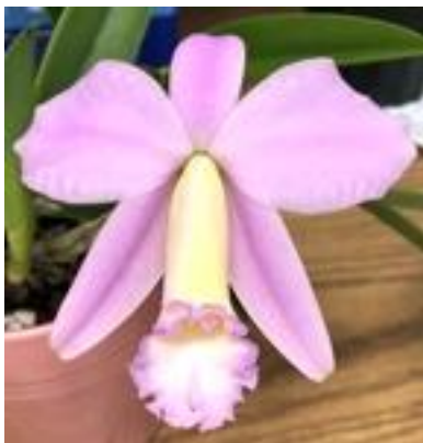
L. Praestans alba