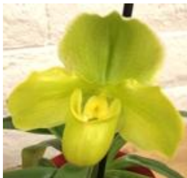
Paph. Irish Eyes