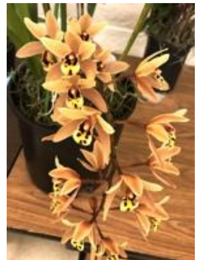
Cym. Butterscotch Pan Shi's Madness