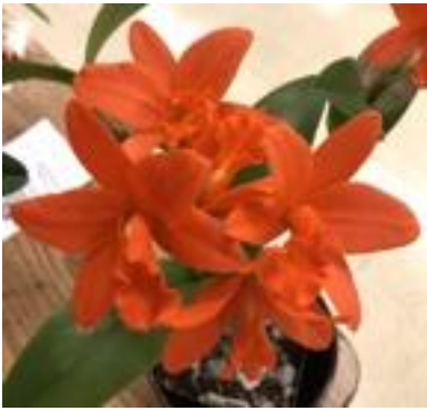
Young Min Orange 'Golden Satisfaction'