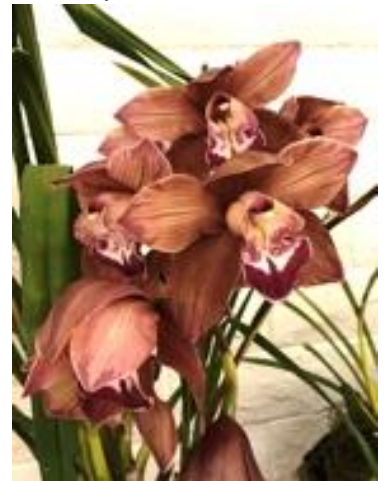
Cym. Red Beauty