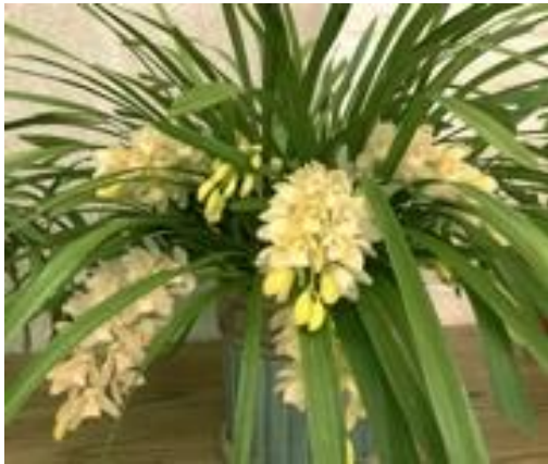
Speaker's Choice: Cym. Polly Stark X dos Pueblos Kusuda Shining 'VE Day' Grown by David West