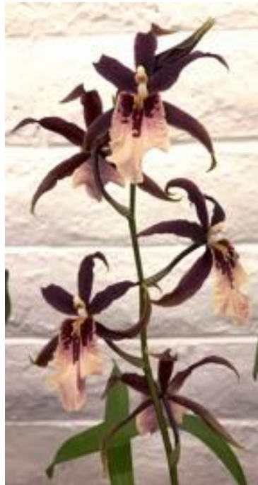
Alkra. Sunday Best 'muffin'