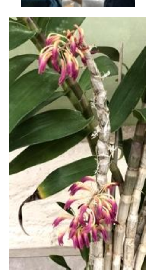
Den. Vista 'Red Coral'