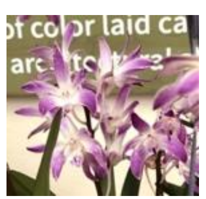
Den. Speciosum X Den Kingianum 'Easter Parade"