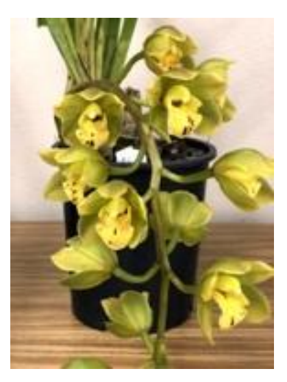
Cym. Fifi "Harry"