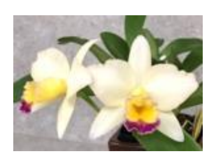
Pot Eye Candy 'Mellow Yellow'