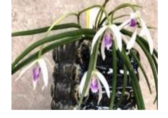
Leptotes . bicolor