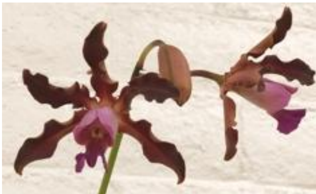
C. leopoldii purpurea brysiiana X Myrmy cophia