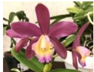
Lc. Sagarik Wax 'African Beauty'