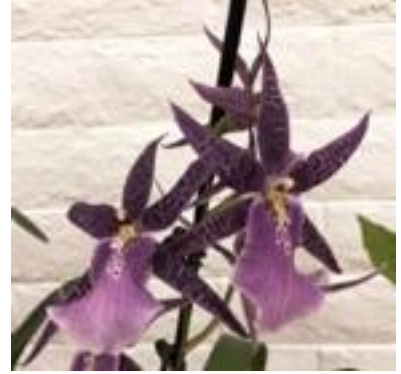
Mtssa. Aztec 'Nalo'