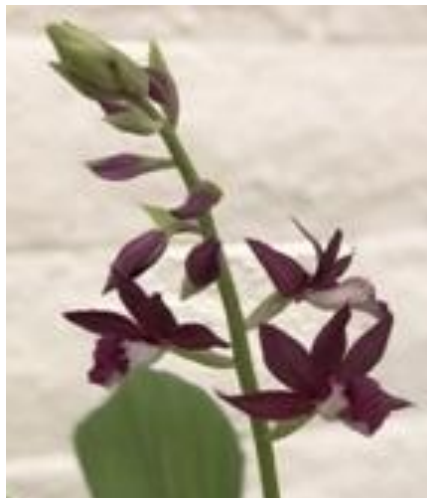
Phaiocalanthe Kryptonite 'Parkside' AM/AOS