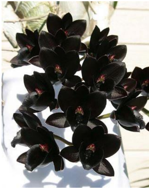
Fredclarkeara After Dark