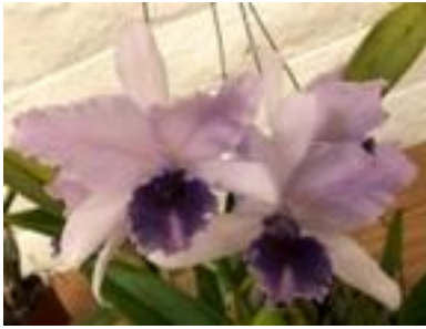
Lc. Mary Elizabeth Bohn 'Royal Flare'