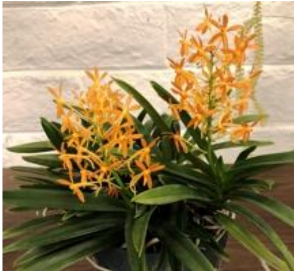
October Speaker's Choice Ascofinetia 'Twinkle' Grown by Bobby Ignacio