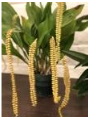
Dendrochilum magnum Grown by Charles Brown