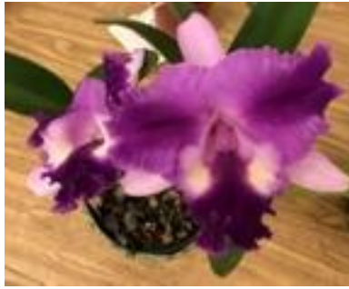
Lc. Pandora Bracey 'Orchid Glade'