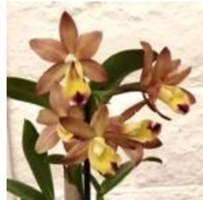
Pot. Risky Business "NN" Loog Tone X Love Passion