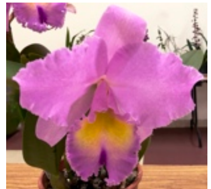
Blc. Pamela Herrington 'Coronation' FCC/AOS