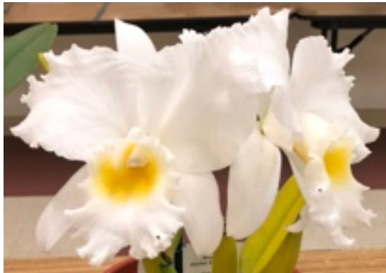
C. Gail Gerber '121787'