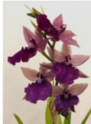
Odta. Pacific Paranoia Grown by Luda Kuprenas

Starting January 3 rd , check our website at www.ocos.net for a current listing of sale items.