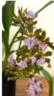
Zygo. Blue Bell