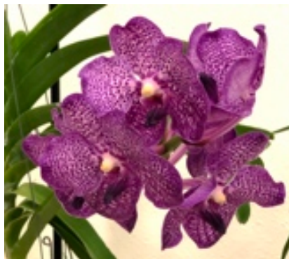
Vanda Hybrid Suphan Pink Beauty