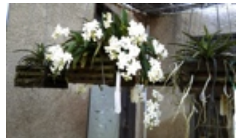
Sarcochilus hartmanii var alba