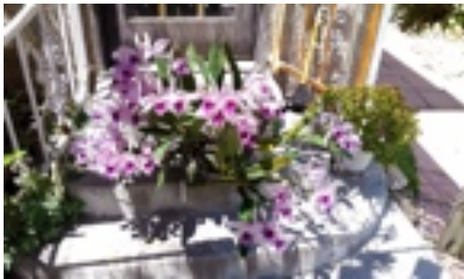
L. Purpurata 62 flowers Grown by Jim Hoyle