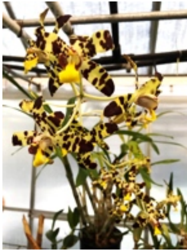
Ansellia Africana 'Primero' FCC/AOS X Ansellia Africana 'Collete' HCC/SAOC Grown by Braulio Mena