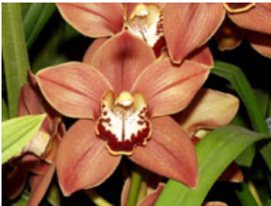
Cym. Gloria Streeter 'North Snow' Casa de las Orquideas

Printed by AcroPrint (310)534-2276 http://www.acroprint.us