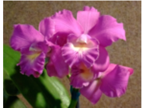
C. Glo Streeter Grown by Art Hazboun