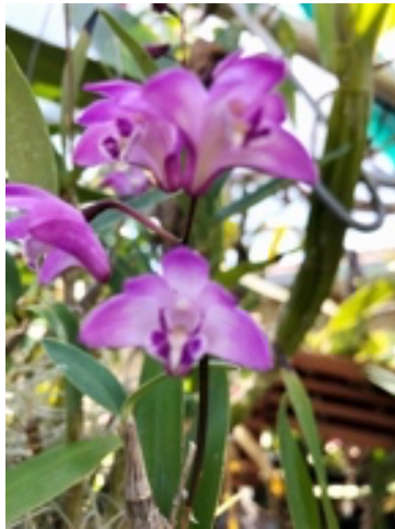
Den. Kingianum Purple Queen Art Hazboun