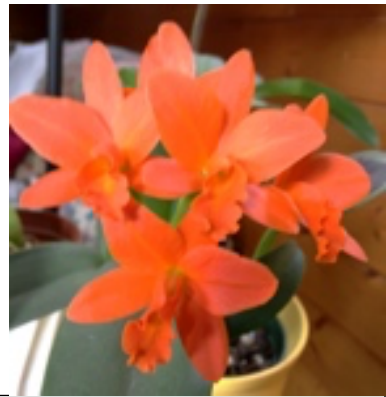
Blc. Young-Min Orange 'Golden Satisfaction'